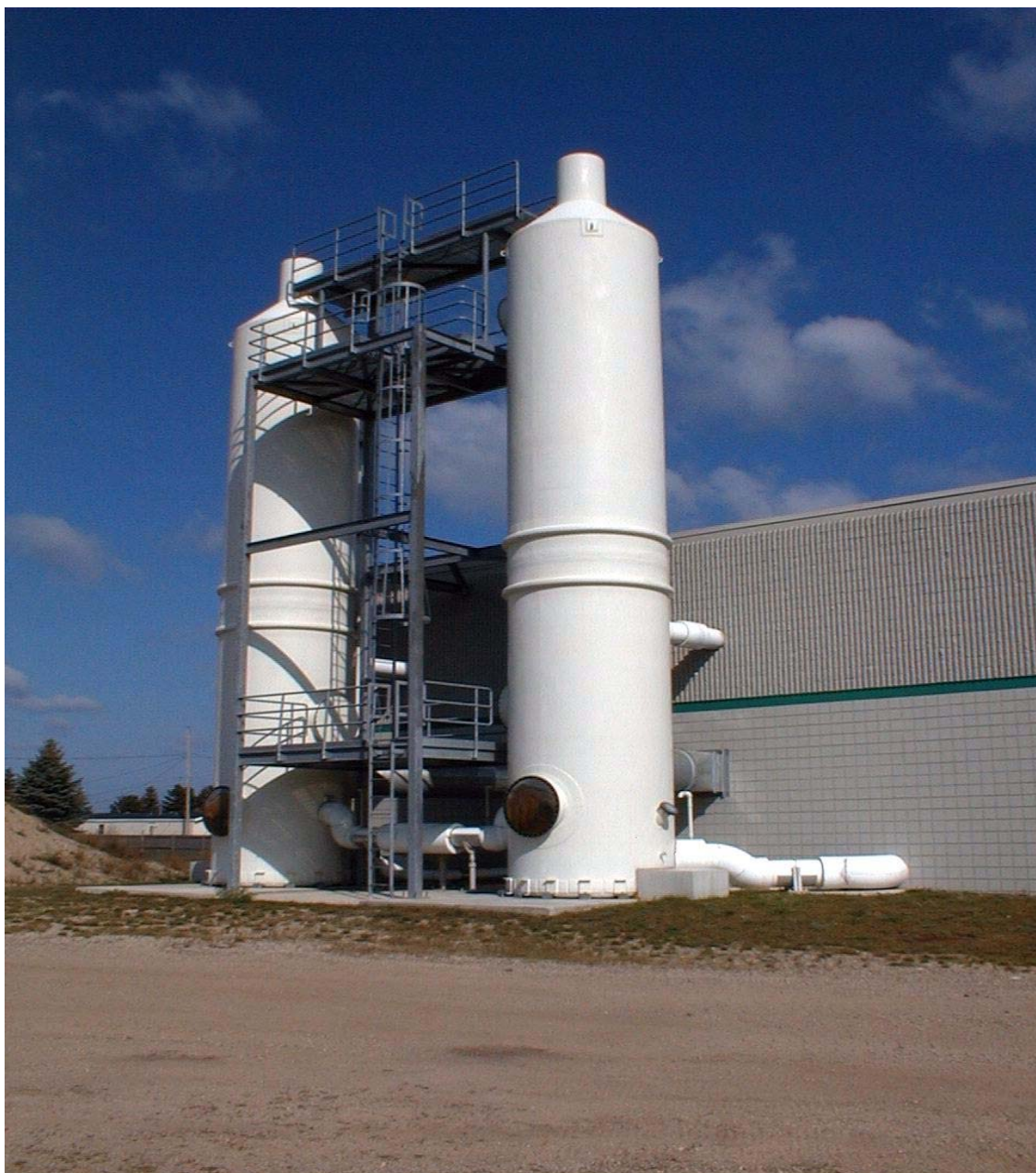
Image of air-stripping tower system printed with permission of the City of Cadillac.

This photograph shows the air-stripping tower system that contaminated groundwater passes through to remove volatile organic compounds.